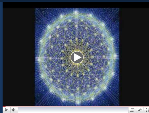
Solar Shifts and Discharging Extra Energy

Considering all of these influences combined, we have a very energetically multi-layered cocktail. If our original energy signatures are being triggered astrologically and our degrees are activated by the grand cross, we will have major energies active in our being at this time at all levels: the day to day stuff, the interfering opposing dark grid and dark forces energies (especially if you are a front liner), the accelerating push of the Solar Galactic Field, and the Grand Cross astro-squeeze. All this while clearing our stuff and undergoing a big refurbishment. Although, we are never given more than we can handle, this can get a bit overwhelming, so don't hesitate to get assistance, in whatever way you feel guided towards, at this time, from myself (see clearing and activation services I offer right now, in section below this article) or from any other healer you feel guided to work with. If you are feeling overloaded, you can also use my process on YouTube, called " Discharging extra energy ", which you can use to discharge your field of excess energy and clear your field, if things get a little too intense.