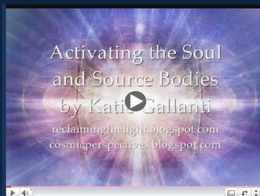
Source Body Activation

We are at the peak of the frequency clash between light and dark and we are approaching a thresholds of light, beyond which we will be beyond the reach of dark influence. The dark forces therefore are doing their job as dark catalyst and trying to recruit as many as they can to their side, as well as being busy in creating as many obstacles as possible for the light holders that are doing the most relevant parts of the "work". This is not something to be frightened about, it is just the nature of a world that is shifting out of light vs dark polarity. The dark polarity has its purpose in acting as trigger for awakening and, in many ways, they are just doing their job in providing us with something to push against and transcend. It is however our job, as light forces, to also do our job, and continue to step up and stabilize our personal and planetary light. We need to be "aware" that our work is important and needed. And it is beneficial to be especially mindful of maintaining strong energy fields and high vibratory and protective practices at this time. To keep your field vibrating high you can meditate, eat right and also step up your fields vibration with processes such as my "Source Body Activation, which you can find for free on YouTube, link here . If you are a front line energy worker and you work with higher dimensional guides and Councils, ask to be given some updated shields at this time and for the next few months to come.