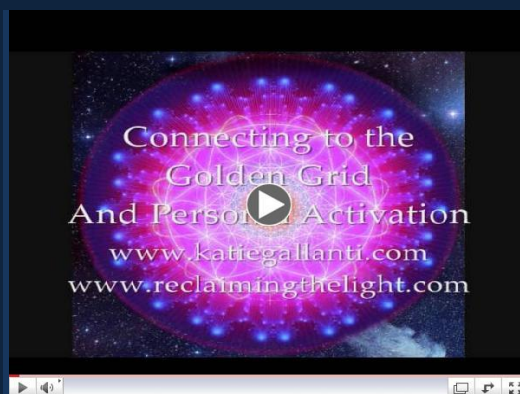
Connecting to the Planetary Golden Grid

I was also guided to work on another grid, which however has been in place now for a while, which is golden in color and connected to the Source energy, allowing for rapid transmutation and for the transmission of really high frequency energy, information planet wide. Last week I talked about this on my show with JP and you can go to my YouTube channel to find both the show and the meditations extracted from that show. If you are drawn to participate in these meditations, as work aimed at stabilizing these grids further and continuing to clear out the discordant war frequencies, know that your contribution is both needed and welcome.